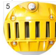
Stainless Steel Screw