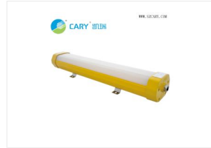
Hot Item KLE1011 UL 844 36W 2FT LED