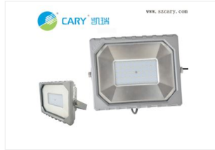
SMD 4KG IP65 36W LED Flood Fixture