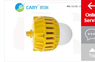
Hot Sale Item 50W KLE1016 LED