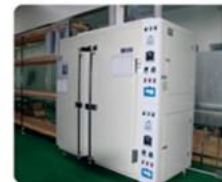
High-Low Temperature Tester