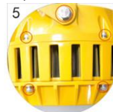
Stainless Steel Screw