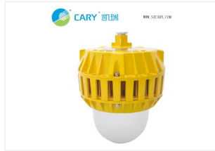
40W LED Explosion-Proof Area Light