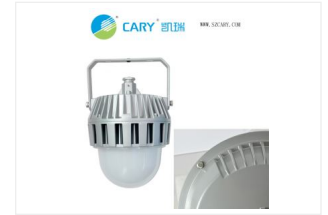
CE ROHS IP65 CARY 50W KLE2018 LED