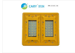
100W LED Explosion-Proof Flood Light